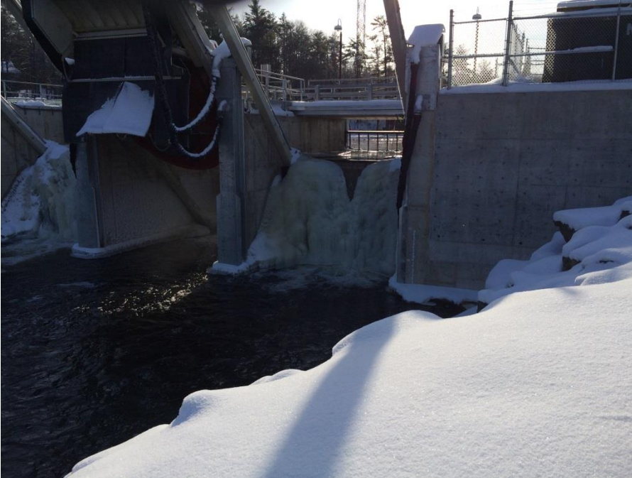
Photo 4 Ice Accumulation on downstream side of VLH Structure

Cold Climate Adaptation. In the photo below you can see the ice build up on the downstream side of the turbine structure and crest gate.