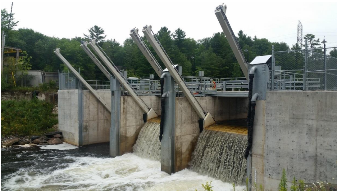
Photo 5 Wasdell Falls Downstream of VLH Structure