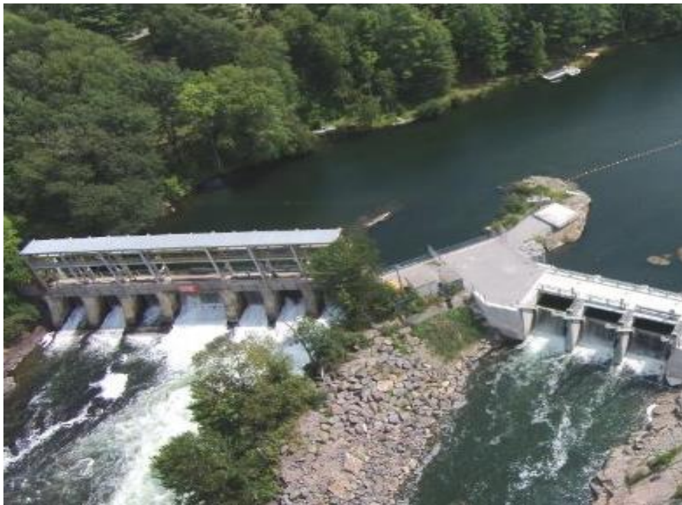
Photo 1 Wasdell Falls Hydro Power Project utilizes Run-of-River technology to produce clean power

Public Project Report Project 495 MH Wasdell Falls Limited Partnership Washago, ON 2016