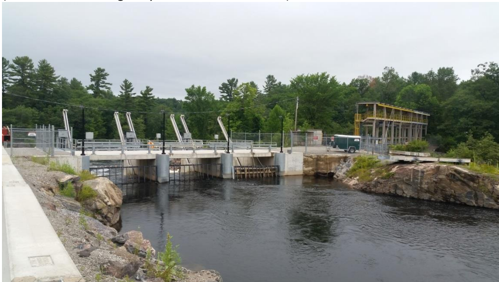
Photo 3 Wasdell Falls VLH Forebay

The photograph below shows the fore-bay of the VLH turbines with the existing dam in the background (located where the gantry structure can be seen)